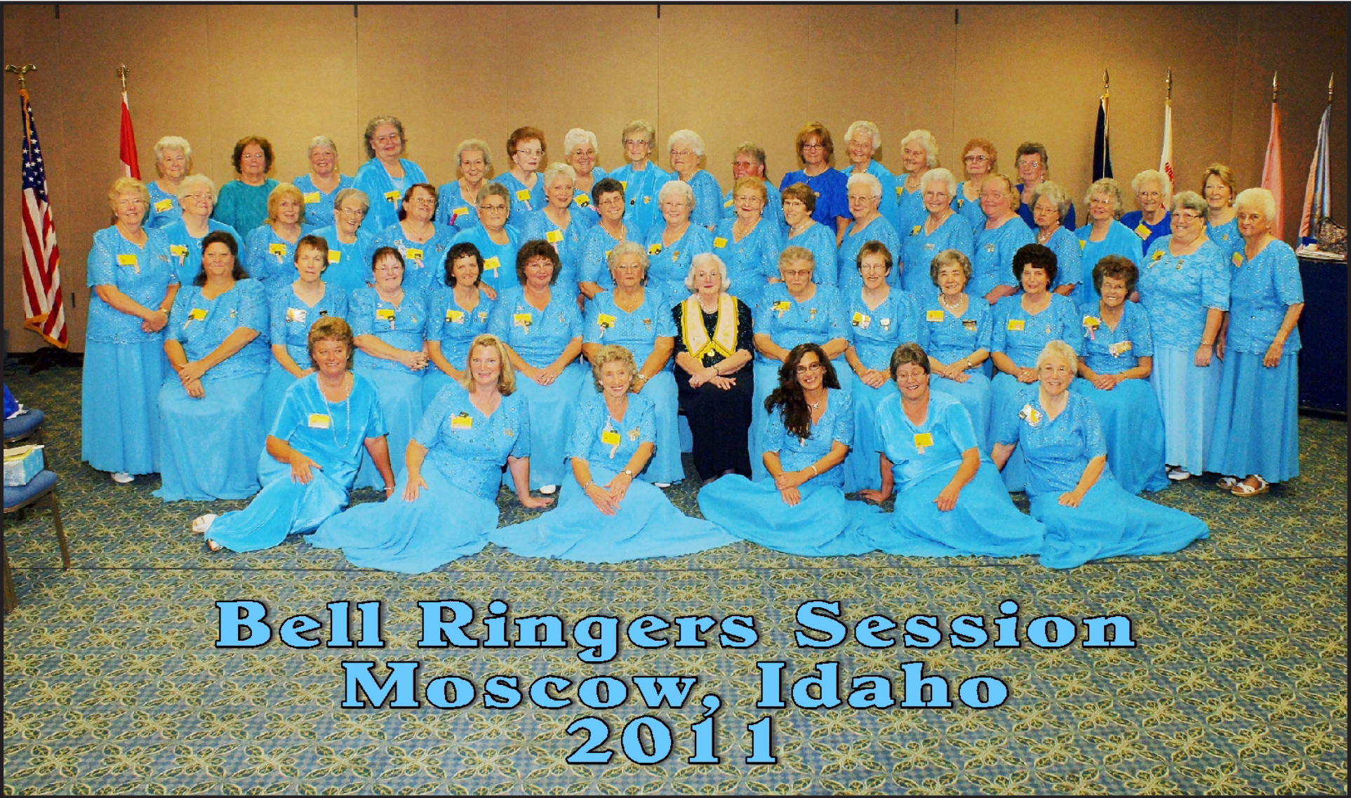
Bell Ringers Session Moscow, Idaho 2011