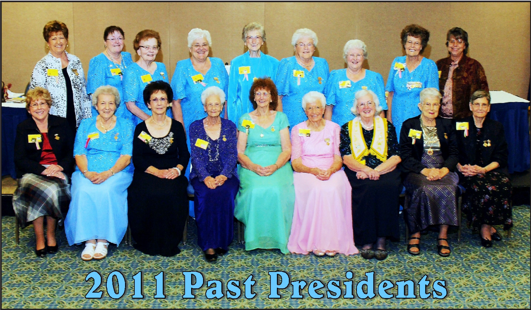
2011 Past Presidents