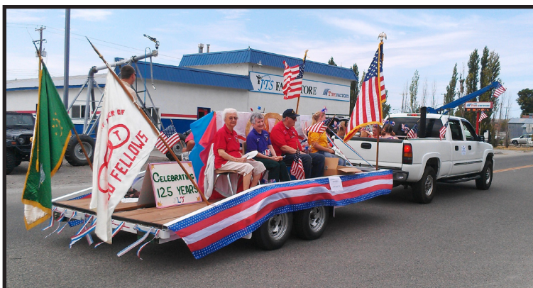
4th of July Parade Glens Ferry