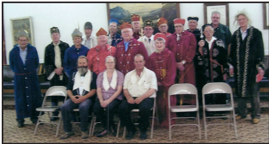
Degree Team with 3 New Initiates in Front

Helping with the ceremonies were members from the following lodges: Pioneer Lodge #1, Silver City Lodge #2, Ada Lodge #3, Caldwell Lodge #10, Mountain Home Lodge #19, Payette Lodge #22, and Wilder Lodge #137.