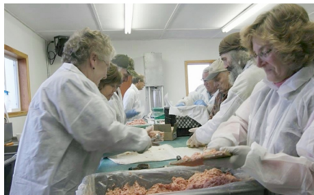
Making Sausage Patties