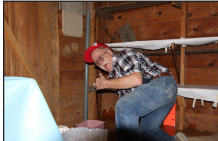
Lodge Set Up