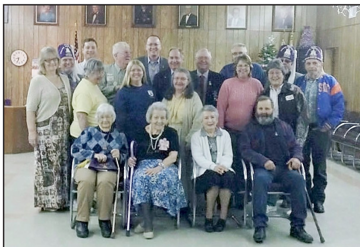
Members of Home Encampment #13