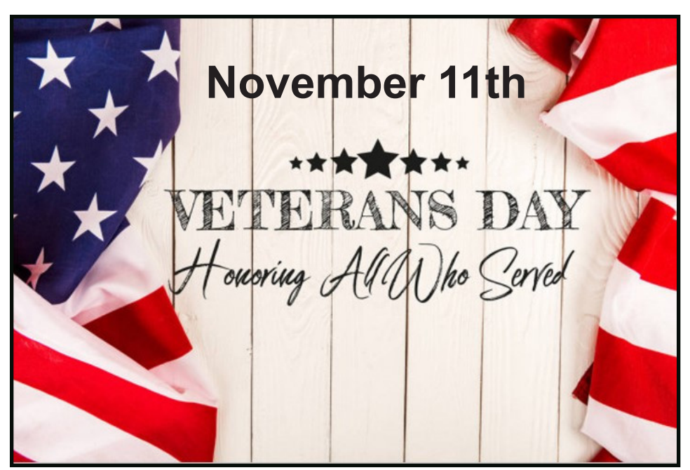
In honor of all of the men and women who have served this country, Happy Veterans Day! Thank you for your service and your sacrifice!