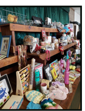
Some of the many Bingo prizes