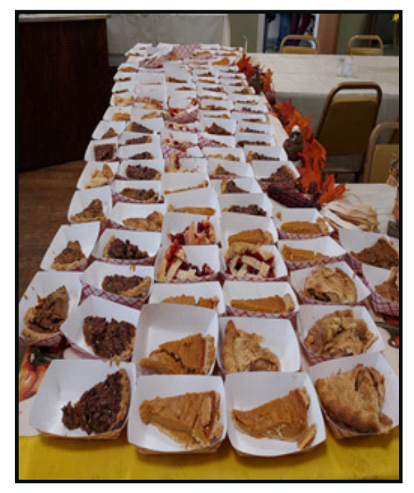
A few of the many pieces of pie

We'd been preparing for this day for some time. Pies were being baked four at a time, turkeys were being prepared, dressing being baked, salads were being made, the Hall decorated, and prizes put together for Bingo. Then the day dawned: Sunday, November 12, 2023. We arrived about 8:30 am, to get ready for Bingo starting at 10:00. We had quite a few people show up for that, and except for when folks were eating dinner, Bingo went on until the very end. We started serving dinner at noon. It was like the dam burst! Everyone showed up at once, flowing through the front doors like a river! The gals had a hard time keeping count of the dinners they were selling because folks were just shoving money at them! Lol... Once folks had paid, they immediately lined up for the food: through the main hall, into the dining room, and around three outside walls before they got to the servers of turkey, mashed potatoes, dressing, gravy and green beans. Then on to the salads, rolls and desserts. It wasn't long before no one could get in to pay, because the line for dinner was right there. It was as crazy as it always is, and it was fun.